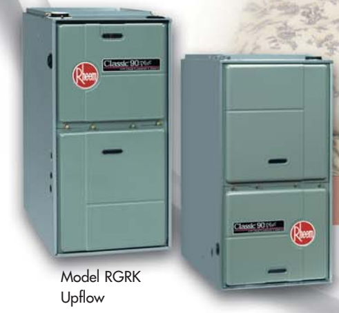
Model RGRK Upflow Model RGTK Downflow/Horizontal